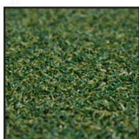
Curly artificial grass