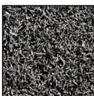
Curly artificial grass